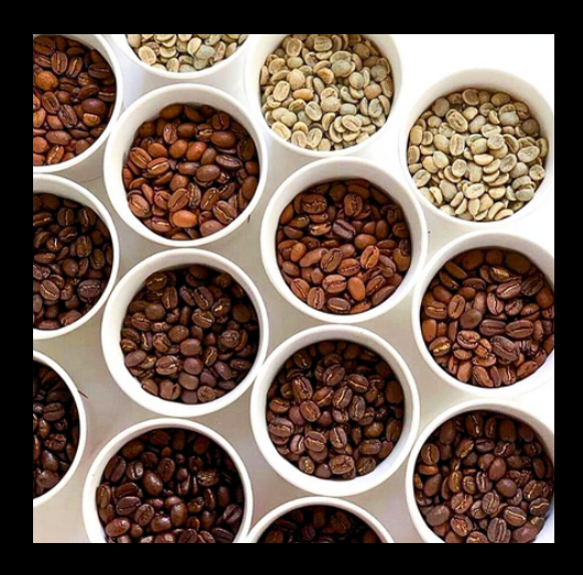
ORGANIC AND SUSTAINABLY GROWN

Our coffee beans are sourced from organic farms that uphold sustainable agricultural practices.